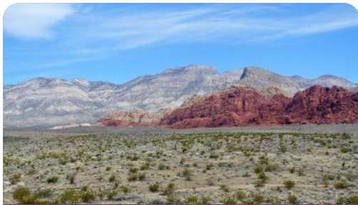
Red Rock Canyon