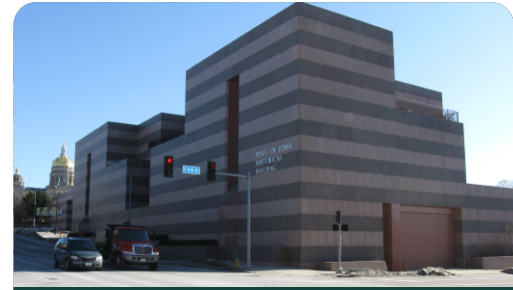
State Historical Museum of Iowa