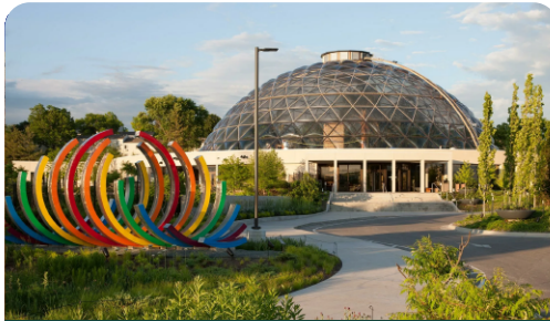
Greater Des Moines Botanical Garden